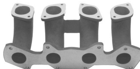
Weber Dual Down Draft

(2.3 Weber manifolds require a crankfire ignition)