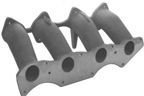
Weber Dual Side Draft

Part# E2725 for Esslinger Aluminum Head (use E3365 Linkage Kit)