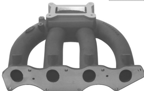
Part# E2727K (SVO) Part# E2727A (ARCA)

2.3 Holley Manifold for a cast iron head (D-Port or Oval Port)